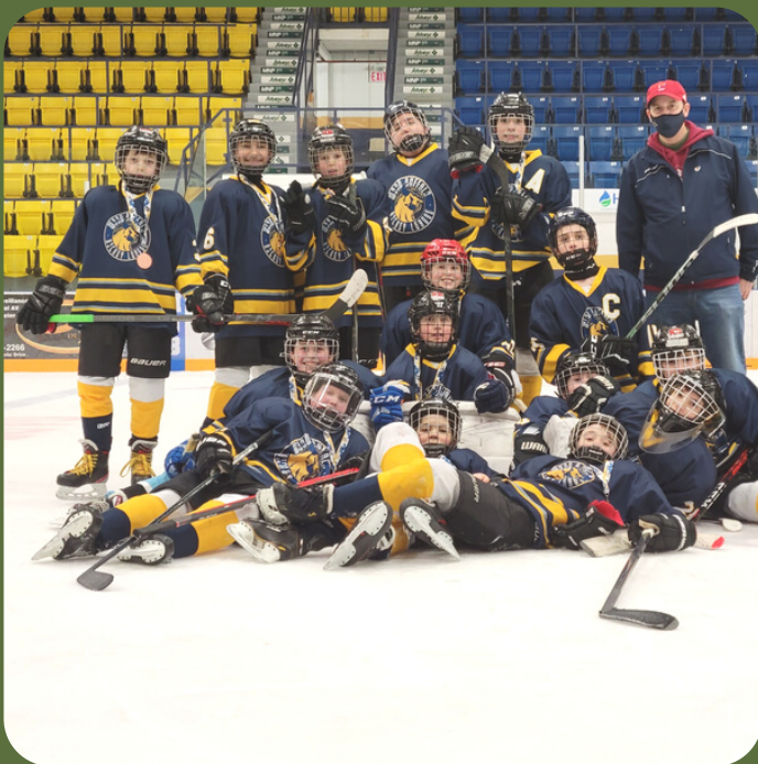
Fort McMurray Minor Hockey

KidSport Alberta formulated a new partnership with the Edmonton Oilers Foundation that resulted in a new program called Hockey Assist Program (HAP) which funded 25 kids locally and invested close to $18,000 back in the minor hockey community in form of hockey registration fees.