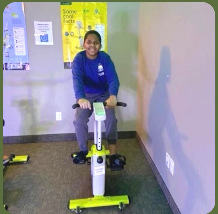
Adaptive Bikes for Autism Society